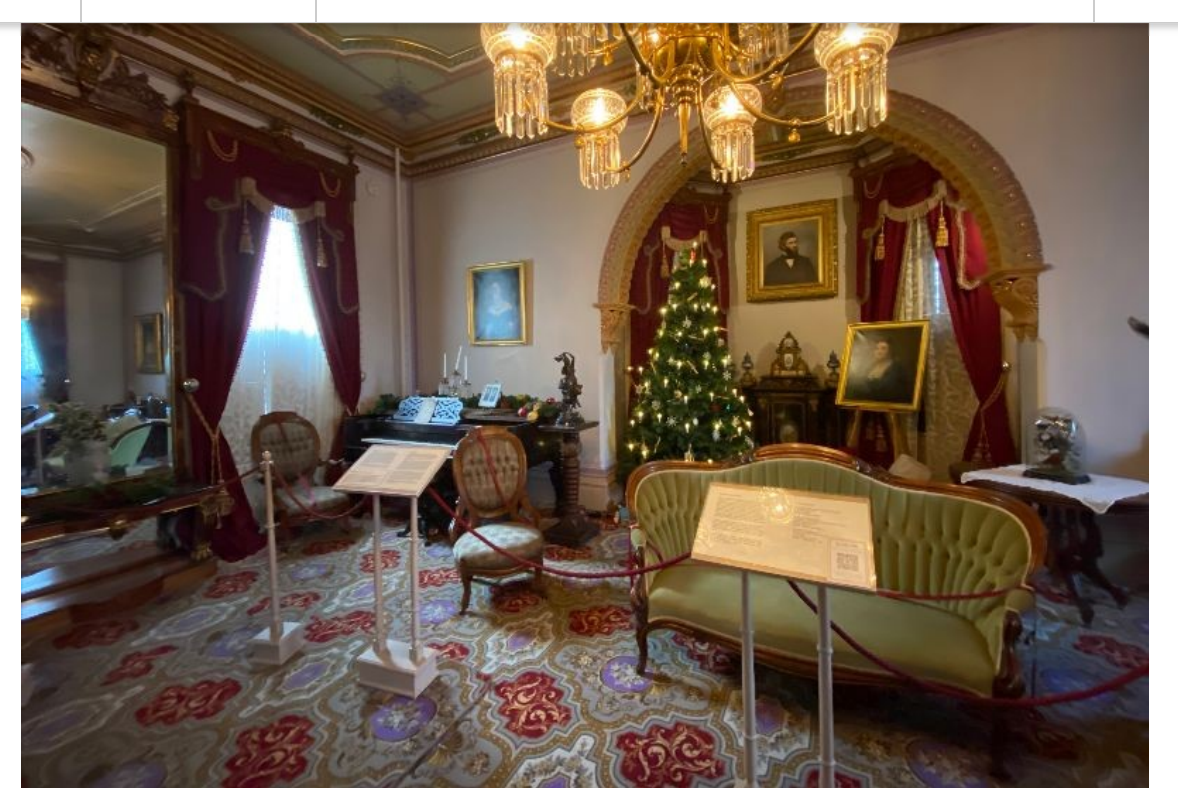
WNYLRC Staff visited the Fenton History Center located in Jamestown, NY. Pictured is the parlor inside the museum.